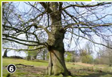
6. Sweet Chestnut Castanea sativa

Look at how the new parts at the top of the tree are different from the old in the lower half.