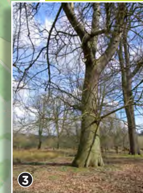
3. Sweet Chestnut Castanea sativa

It is on the left when you are facing the really long road. Notice how this tree looks especially twisty!