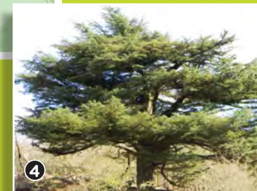
4. Cedar of Lebanon Cedrus libani

This tree looks like a very large Christmas tree.