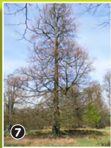
7. Beech Fagus sylvatica

Can you get around the tree walking only on the roots?