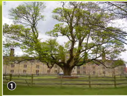
1. 200 year-old Sycamore Acer pseudoplatanus

(fenced off) It is inbetween the house and car park. Information about the tree can be found on the information plaque