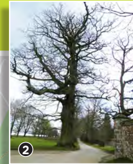
2. Oak Quercus sp.

(fenced off) It is inbetween the house and car park. Information about the tree can be found on the information plaque